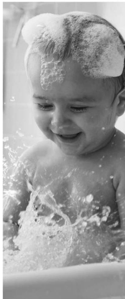
Figure 2: Multisensory stimulation via a bath time routine